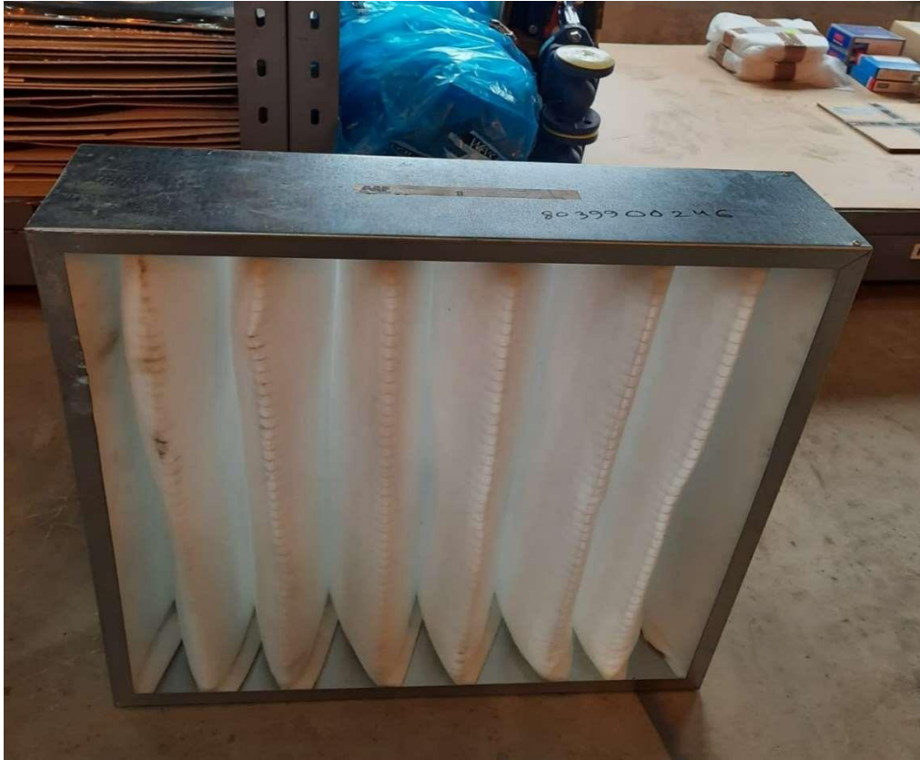
Figure-3: Charge Air Filter of Gazipur Power plant.