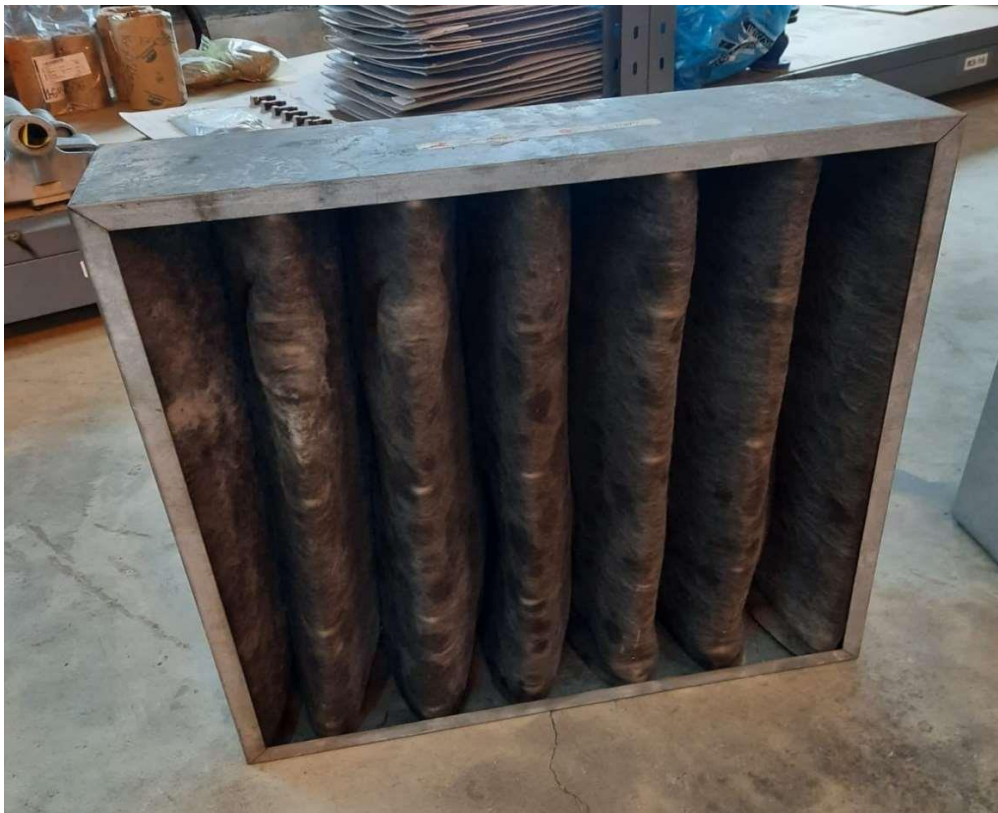
Figure-2: Charge Air Filter of Gazipur Power plant