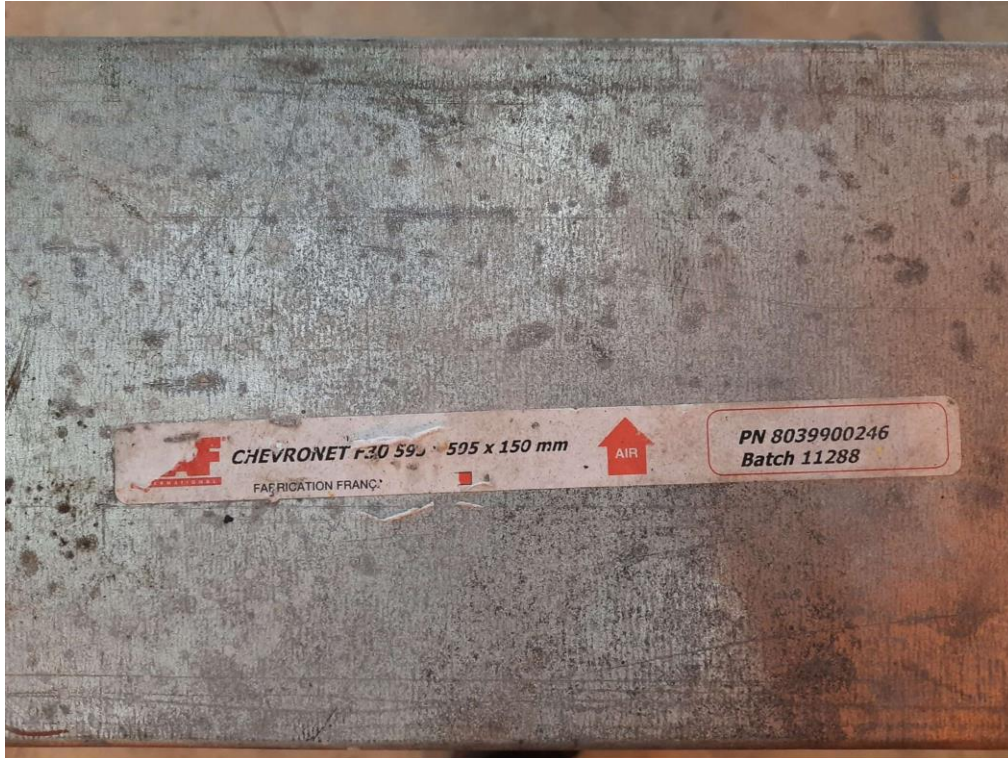
Figure-1: Nameplate of Gazipur Power plant