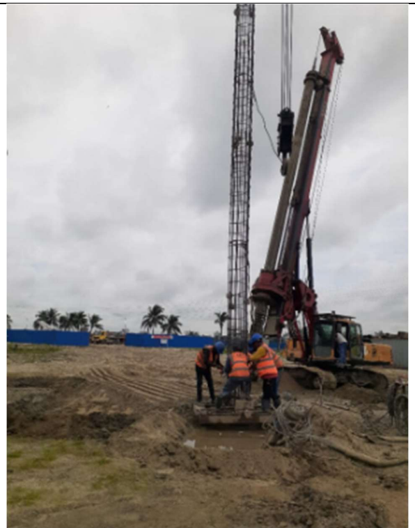
ST Excitation Room piling activities