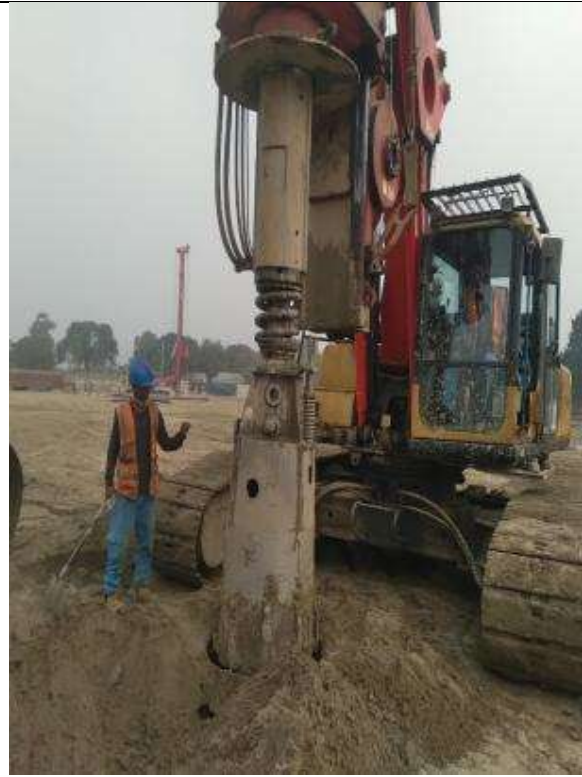
Casting of Pile of Different Structure.