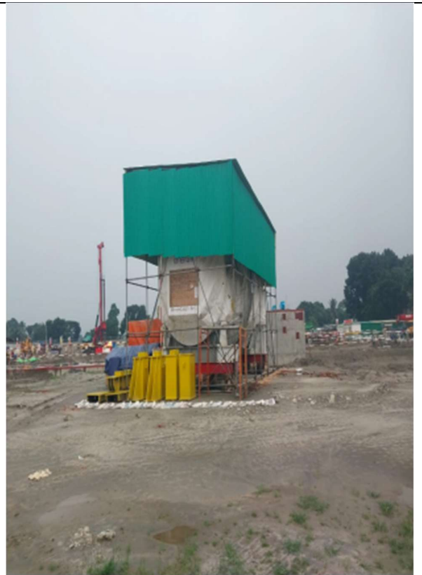
Some Visual Updates of Gas turbine shipment and unloading & transportation