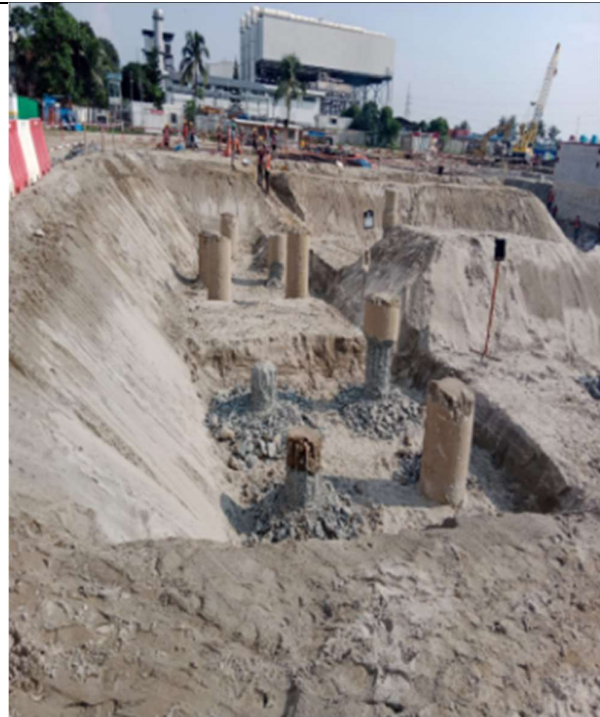
GT Hall Earth Excavation for Pile-head exposure and breaking ongoing