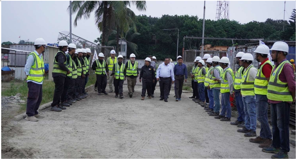
Honorable Managing Director Sir and Honorable Executive Director Sir Visited 360MW (+-10) Power plant Project.