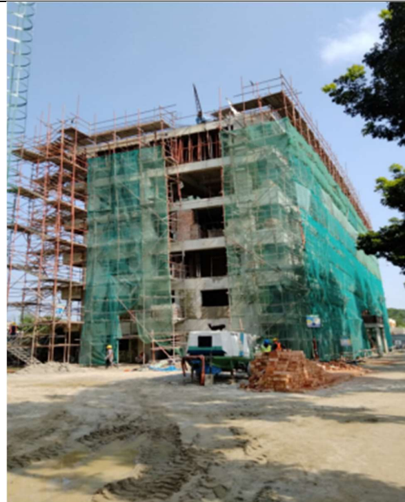
Dormitory Building (6th floor) Slab Concrete and superstructure works.