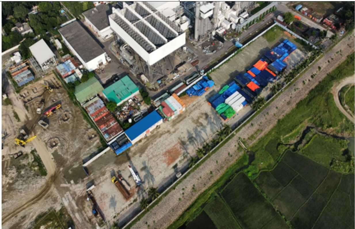
Temporary Material storage Area of the equipment's arrived at site.