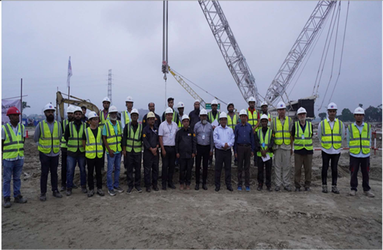
Visit OF Honorable Managing Director of RPCL along with High official of MPS 210 MW & Stockholder at Mymensingh 360(+/-10) MW CCPP Project