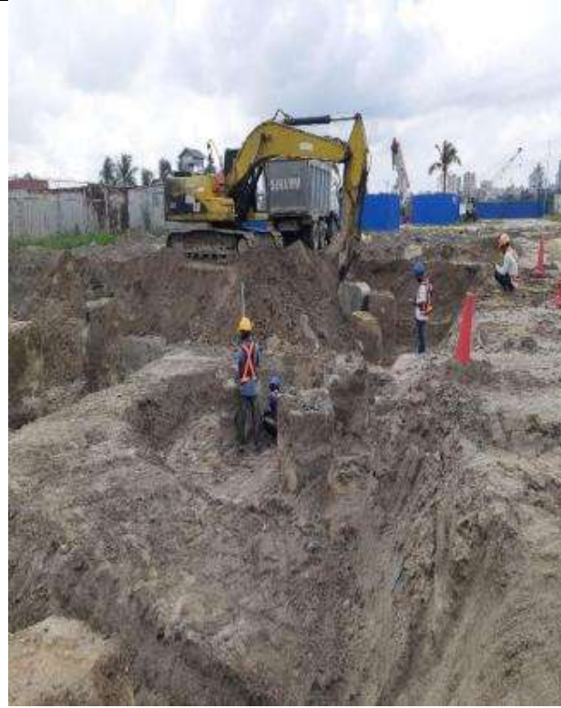
Workshop & warehouse building foundation pile cap exposure ongoing