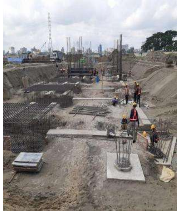
Central Control & Admin building foundation work ongoing