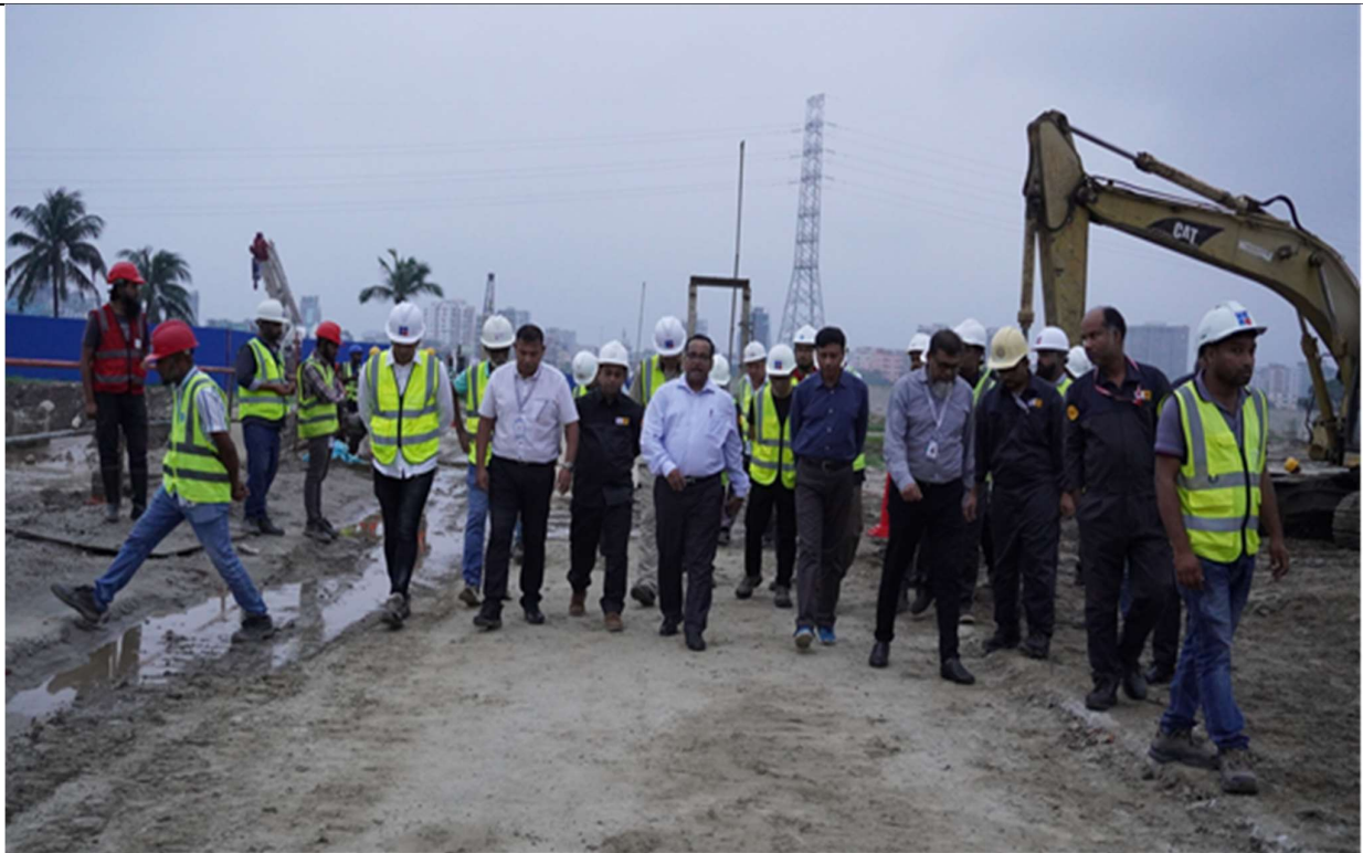
Visit OF Honorable Managing Director Sir & Executive Director Sir of RPCL along with High official of MPS 210 MW & Stockholder at Mymensingh 360(+/-10) MW CCPP Project