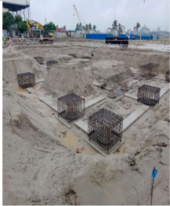
UNIT Switchgear Building foundation rebar work ongoing