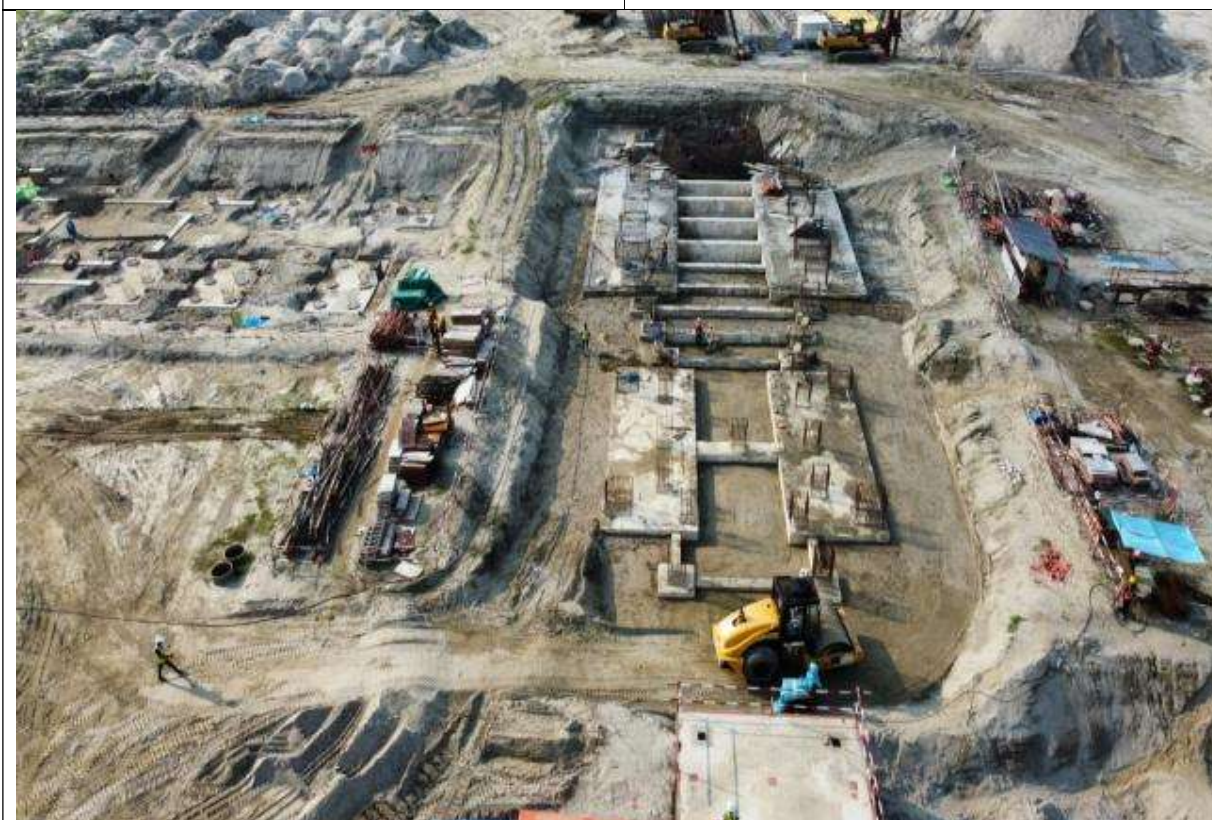
HRSG foundation work