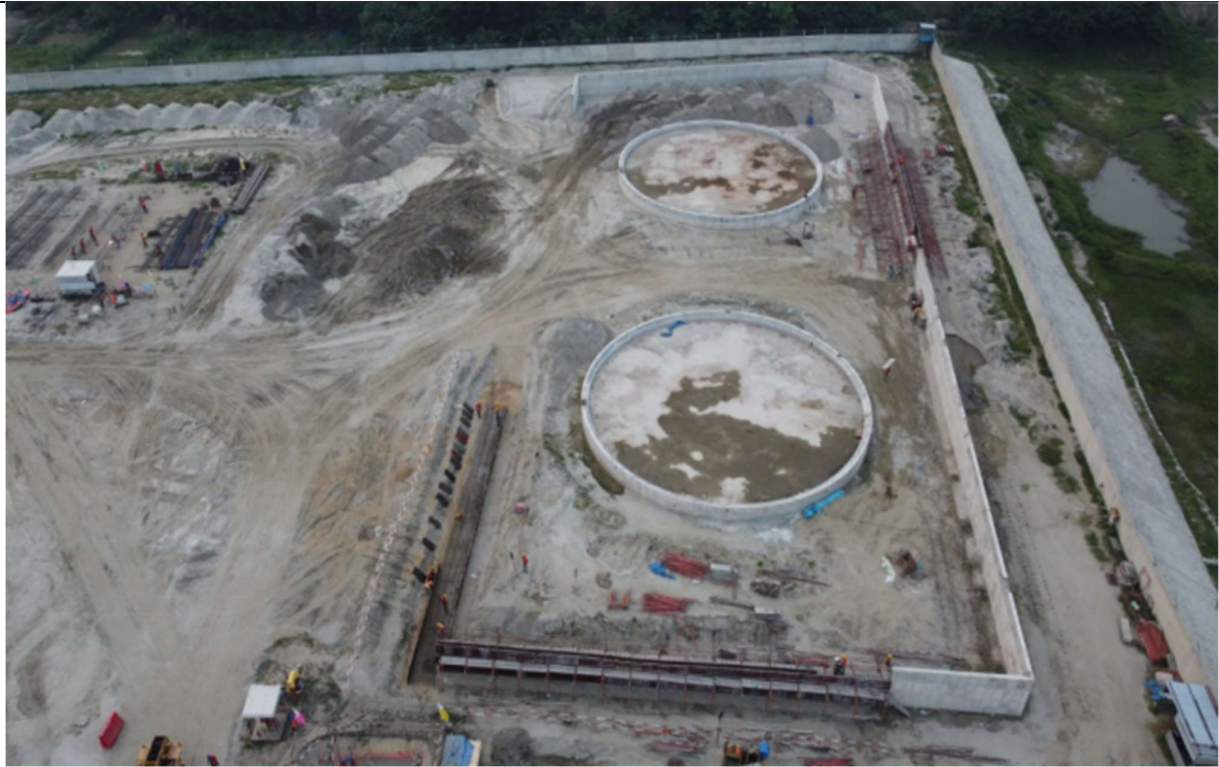
Foundation mass concrete casting for Oil Tank-1&2 and Dike wall