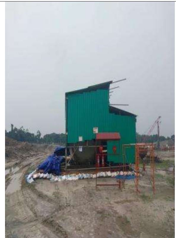
Some Visual Updates of Steam turbine generator (Stator & Rotor) unloading from barge to jetty & Site.