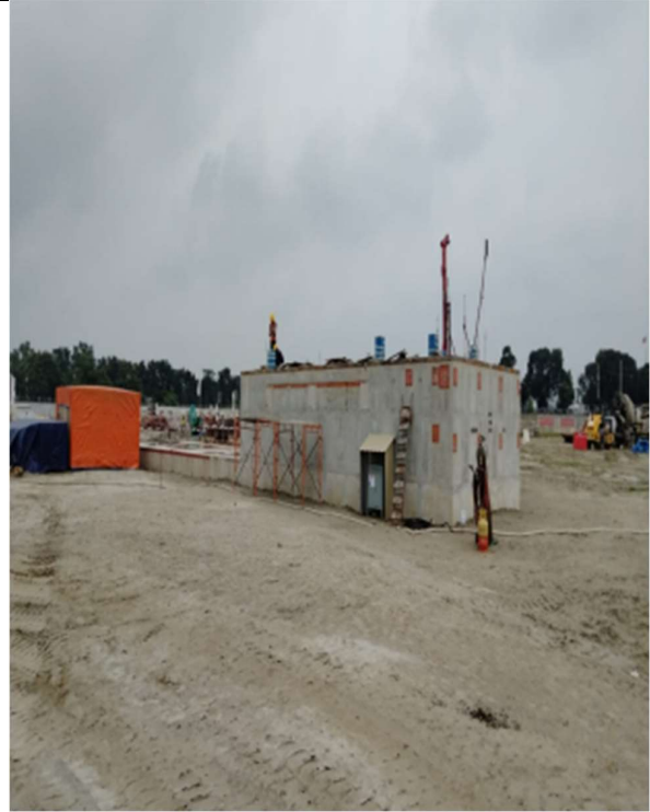
Some Visual Updates of GT & GTG base foundation